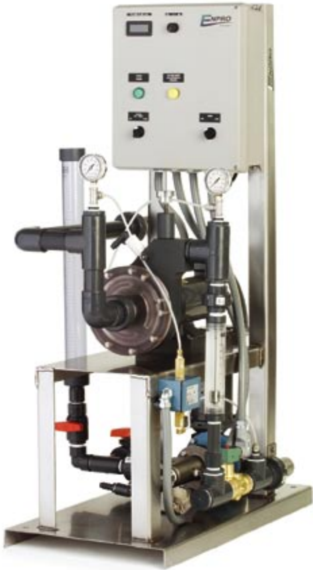
HM-P Series shown